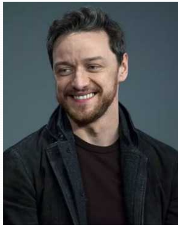
James McAvoy JOHN