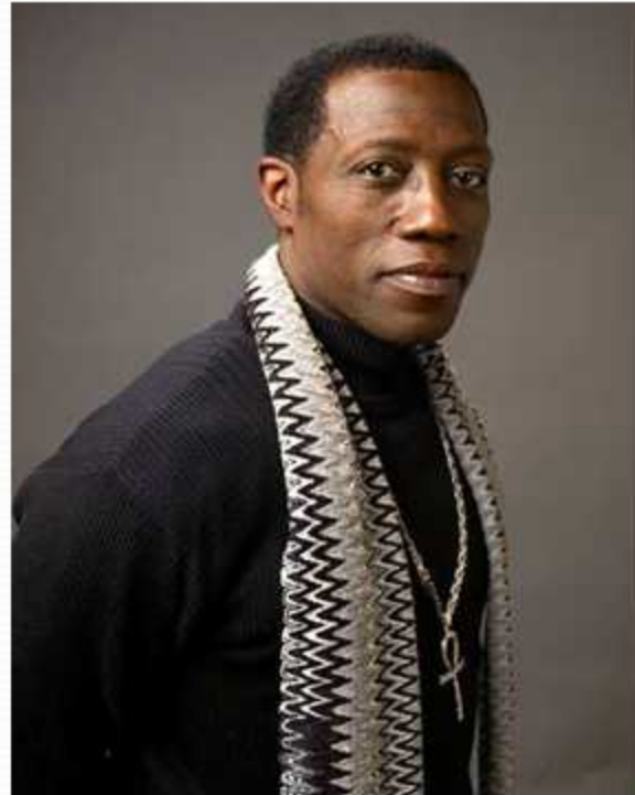
Wesley Snipes OMAR